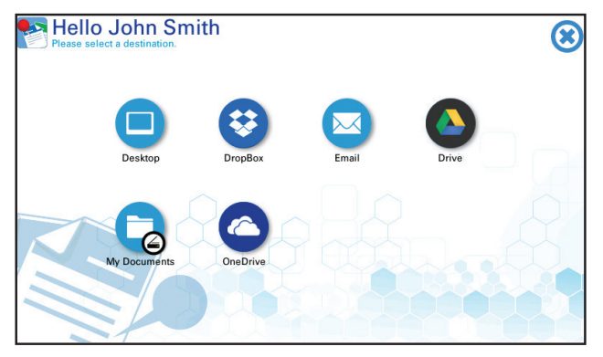
Easy access to PinPoint Scan 3 destinations from the MFP control panel

PinPoint Scan 3's robust new feature set makes it easy to create and manage individualized scanning from the desktop